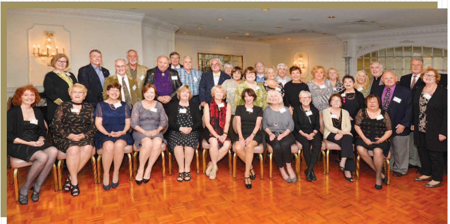
Class of 1964 – 55th Reunion