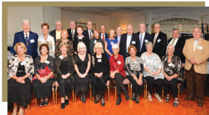
Class of 1963 – 56th Reunion