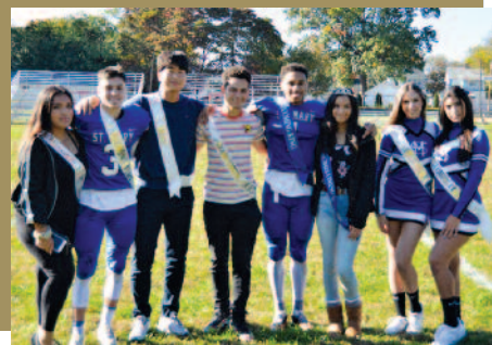
Homecoming King & Queen and Homecoming Court