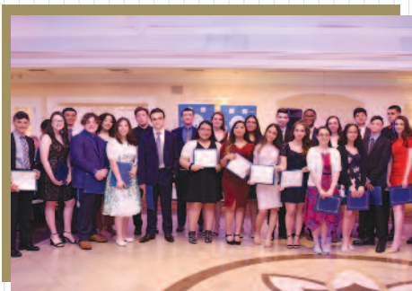
2019 Merit Scholars