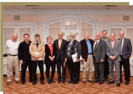
Special Recognition Award recipients, Gael players from St. Luke's High School