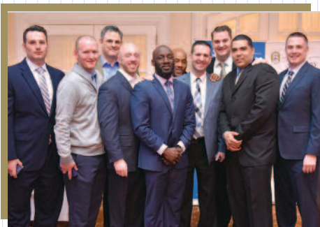
Members of the Hall of Fame 2000 Gaels Basketball Team