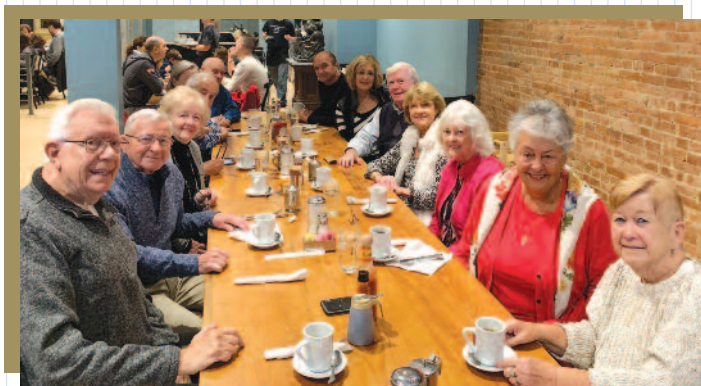
Class of 1959 – 60th Reunion